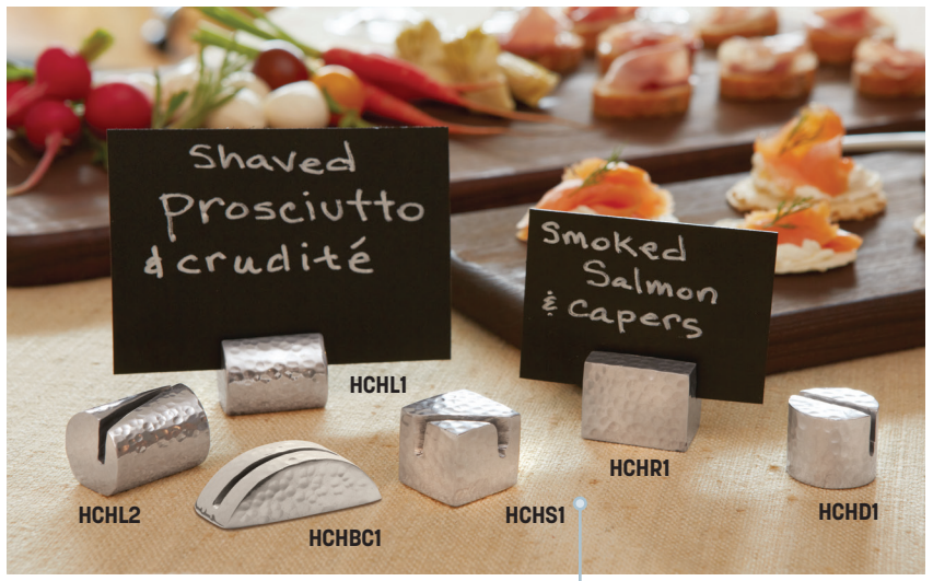
Shown with TAGA8WT and TAGA7WT mini chalk cards